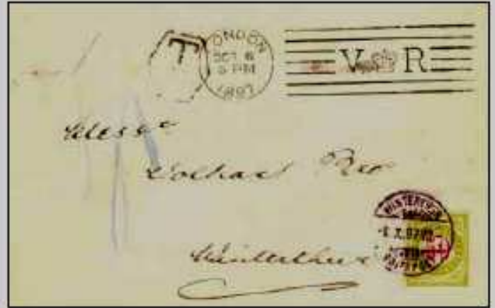
Fig. 30 — Postmark dated 6 October 1897, on a commercial cover to Switzerland with postage due covering the 2½d postage and similar penalty. Only recorded overseas example from the Bickerdike trial phase.