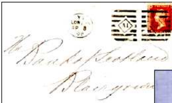
Fig. 14 — Postmark from the First Trial with a coded dater dial having 'YI' and a split obliterator (only known example). Single-weight (1d) folded letter dated 8 April 1869.