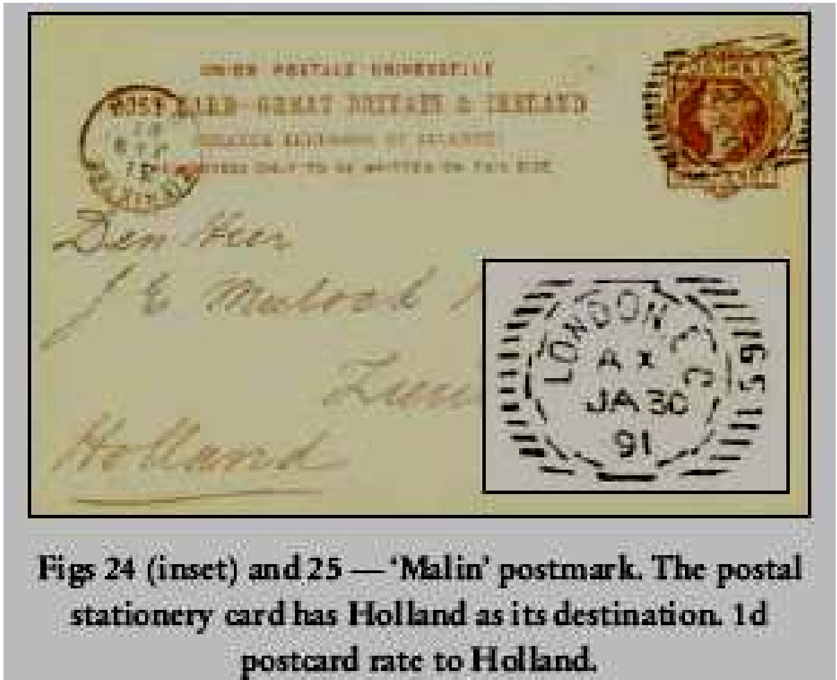
Figs 24 (inset) and 25 — 'Malin' postmark. The postal stationery card has Holland as its destination. 1d postcard rate to Holland.

From the six recorded examples, it appears that the Malin Machine may have been dedicated to apply origin-postmarks to outgoing-mail having overseas destinations.