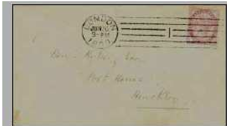
Fig. 33 — 'Boston Machine' postmark from the second trial period of 1899-1900 with number '1' appearing in the postmark obliterator.

The postmarks of each machine tried at London and Liverpool were numbered which is reflected in their respective obliterators.