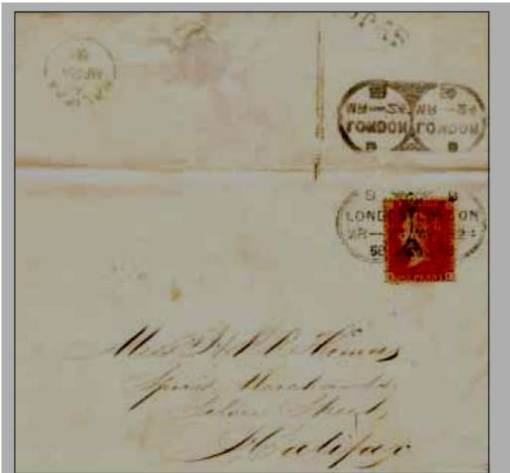
Fig. 4 — Because of its unusual design, markings from Pearson Hill's 'second machine type' ('B' die) became known as 'Opera Glass' postmarks. This example from 24 March 1858 is a folded letter with the back-flap folded out to illustrate the offset from the die and stamping pad.

Typical for postmark impressions of Hill's first and second machine designs were the offset postmark markings as shown in Figs 2 and 4 above. In an attempt to eliminate those, thereby achieving reduction of ink-waste as well as a cleaner postmark, Hill placed an inked ribbon between the metal die and the mail to be postmarked. This eliminated the need for the 'glue and treacle inking rollers' of the two previous machines. Thus, Hill's 'third' machine design ('C') was developed and used a less-ornate postmarking die consisting of two adjacent 19 mm diameter dated and coded single-circle dials (See Fig. 5). Known trial usage: 8-18 March 1858.