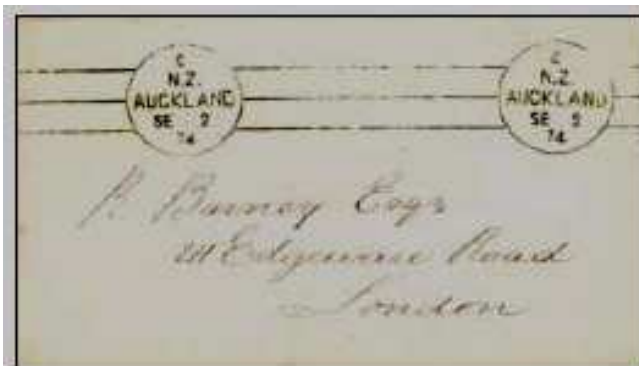
Fig. 19 — One of five reported surviving examples in private collections from the Vaile postmarking machine trial of April 1878, and the only known example having the illustrated postmark design. This cover illustrates a ‘shadow’ offset of the zig-zag pattern obliterator from the same trial.

Despite the trial having taken place at London in 1878, all dater dials indicated ‘C / N.Z. / AUCKLAND / SE 2, 74’. However, no mail was actually processed for delivery. Only seven recorded examples from that demonstration have survived, two of which are in the British Postal Museum & Archive.