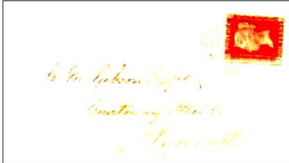
Fig. 5 — Example from Hill's 'C' Machine. Envelope dated 11 March 1858, sent from London to Plymouth having Die 'CA'. One of four recorded covers.

This design, having an inked-ribbon between stamping die and the mail involved, was discarded by Hill at the end of March since he found the inking process using the earlier 'glue and treacle inking rollers' better. That method would subsequently be used on Hill's 'Parallel Motion Machine', which was much simpler and less bulky in design.