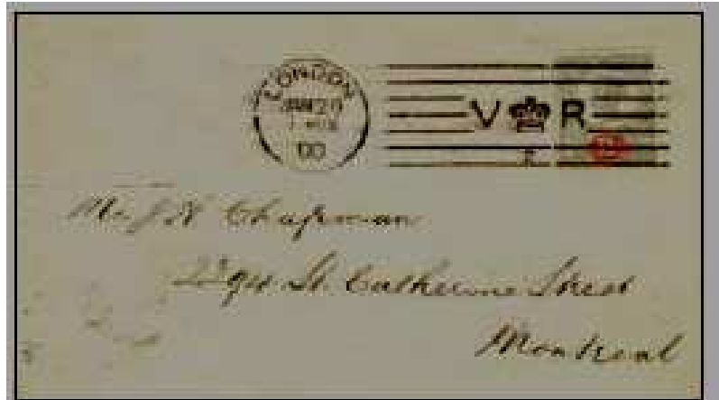
Fig. 34 — 'Bickerdike Machine' postmark from the second trial period of 1899–1900 with number '2' appearing in the postmark obliterator.

Upon the demise of Queen Victoria on 22 January 1901, the British Post Office ordered the alteration of the Bickerdike postmark obliterations from 'VR' to 'ER', since Edward, her eldest son, now became king. Such change took place mid-year 1901. However, although the initials changed in the obliterator, the 'Victorian Crown' remained in use with the 'ER' initials until it also was altered by September, 1901!