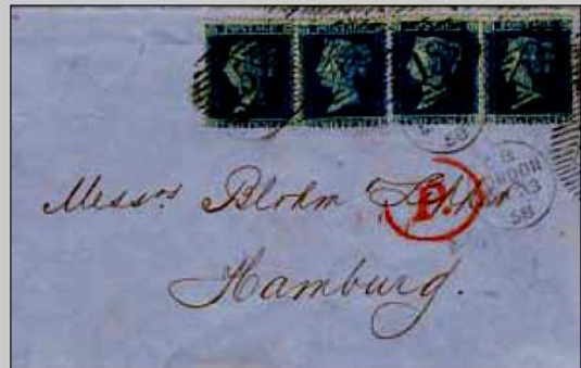
Fig. 7 — Pearson Hill 'C' Machine postmark on the front of an outgoing letter to Germany. Note 19 mm dater dial with new duplex obliterator or 'killer'. Only known cover illustrating the earliest date of use: 23 March 1858.