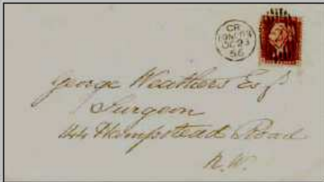
Fig. 13 — Postmark from Rideout's Second Trial at the London Post Office. Machine '2' usage from 23 October 1866 to 10 July 1867. This example illustrates a 19 mm diameter dater dial with 'CR' and duplex obliterator having '2' between nine thick vertical bars. This cover is the earliest known usage from Rideout's Trial using Machine '2'.

Hill's Parallel Motion Machine and a version thereof called the 'Pivot Machine' became widely used and 'mainstays' in the British Post Office for many years. Despite such widespread usage, the Post Office continued to evaluate other machine designs, which potentially could improve the postmarking and handling of mail. Most of the machines to be tested were now of non-British design and manufacture.