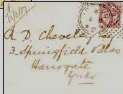
Fig. 22 — Example of a 'Dot Matrix' Hoster marking on an 1887 mourning cover.

The 'Hoster' machine was hand-operated having two postmarking dies able to postmark two pieces of mail with each rotation of the hand-wheel. During the field-trials and usage years 1883–1893, Hoster machines applied a number of different origin markings to out-going mail and also receipt markings to in-bound mail.