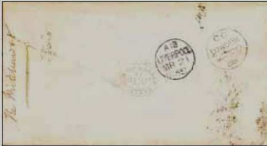
Fig. 6 — Pearson Hill 'C' Machine 'service or receipt' postmark on the reverse of an in-bound letter. Note 19 mm single circle dater having 'CC' code in dial. One of two recorded examples from the earliest day of use: 20 March 1858.

itself, e.g. 'A' = Monday, 'B' = Tuesday, 'C' = Wednesday, 'A' = Thursday, 'B' = Friday, 'C' = Saturday (see Fig. 7). No code for Sunday when no mail was postmarked.