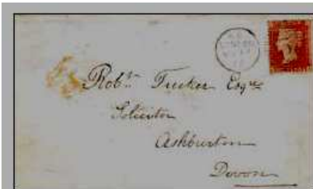
Fig. 10 — Postmark from Hill's 'Parallel Motion Machine' on a single-weight cover from London to Ashburton dated 14 May 1858, earliest known usage. Postmark: 19 mm diameter dater-dial with 'LONDON' 14 mm in length along with a duplex obliterator (1.75mm from dater dial) having a '3' between 17 thin lines.

Hill officially introduced his new 'Parallel Motion Stamping Machine' to the Post Office on 13 May 1858, they started trials one day later – 14 May 1858, the earliest recorded usage. Testing continued from 1858 to 1860 along with post-experimental usage several years beyond and with a number of postmark varieties recorded.