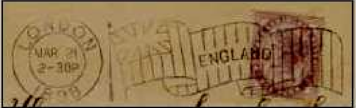
Fig. 31 — 'Empire Machine' postmark from 21 March 1898. One of five recorded examples.

Trials for that machine were held only four days, 15, 17, 18 and 21 March 1898, for one hour each day. Although the 'Empire Machine' looked and functioned similarly to the 'Bickerdike' which had been tested a few months earlier, its performance was inferior to the 'Bickerdike' and was rejected for additional consideration by the Post Office.