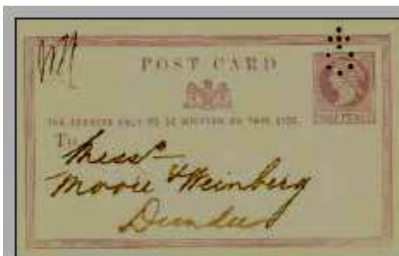
Fig. 17 — Sloper perforation 'Standing Orb & Cross' on postcard dated 2 November 1870. Earliest known example.

Several perforation or mutilation approaches were used during the five-year trial duration period. A 'Cross & Orb' perforation design was the first used at London. Examples from that trial are very scarce and known from 2-3 November 1870 for the 'standing orb' and from 9-21 November 1870 for the 'inverted orb'!