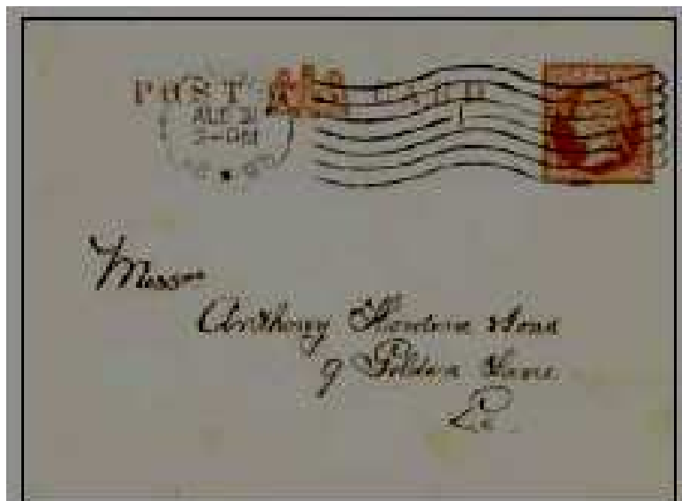
Fig. 32 — 'Boston Machine' postmark dated 31 August 1898, from the trial period, on a domestic postal stationery postcard. One of twelve examples recorded.

The American Postal Machines Company of Boston offered to supply the Post Office twelve of their machines at a very favorable price and conditions. Learning of this, and since the Post Office was quite satisfied with the outcome of the 'Bickerdike' Trials, the Canadian Postal Supply Company matched the competitor's offer resulting in the Post Office deciding to lease six machines from each company. Those machines, now referred to as 'Bickerdike' and 'Boston' machines, were subsequently tried for another year and were successful.