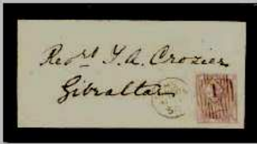
Fig. 8 — Postmark from Ridout's Test Machine 1, Type I. Mourning cover to Gibraltar. Single-weight letter rate — 6d.