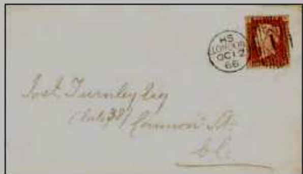
Fig. 12 — Postmark from Rideout's Second Trial at the London Post Office. Machine '1' usage only known on two covers: 10 & 12 October 1866. This example illustrates a 19 mm diameter dater dial with 'HS' and duplex obliterator having '1' between 11 thin vertical bars. This cover is the earliest known usage on a domestic local single-weight cover.

Although Person Hill's 'Parallel-Motion' Machine had been selected in 1859 as the one to be purchased by the General Post Office for field use, Charles Rideout pressed the post office for additional trials. Between October 1866 and July 1867, a second trial was conducted for Rideout on two improved machines which, however, ended in failure. Hill's design was determined to be more robust, more effective in stamping and field usage. Whether the influence of Rowland Hill, Pearson Hill's father, holding an important position in the Post Office, had any influence in this matter can only be speculated.