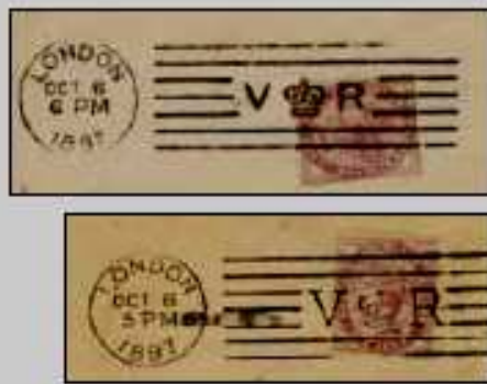
Fig. 29 — Two postmarks designs were used for the trials, one type for each machine: one with, and one without, serifs to the 'VR' in the obliterator.