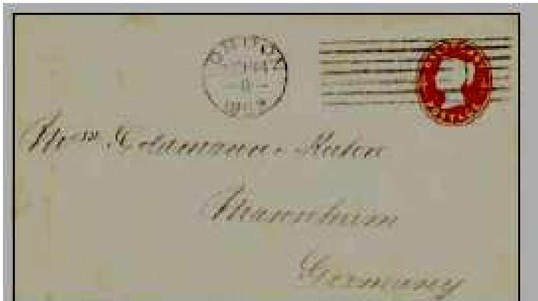
Fig. 26 — ‘International Machine’ postmark on a 14 September 1893 (only known example having this latest-known usage date), postal stationery envelope to Germany. Halfpenny printed-matter rate to Germany.

The postmark applied by the ‘International Machine’ had a 22 mm diameter single-circle daterial along with a seven-line (52 mm length) obliterator having the numeral ‘1’ on the right-side.