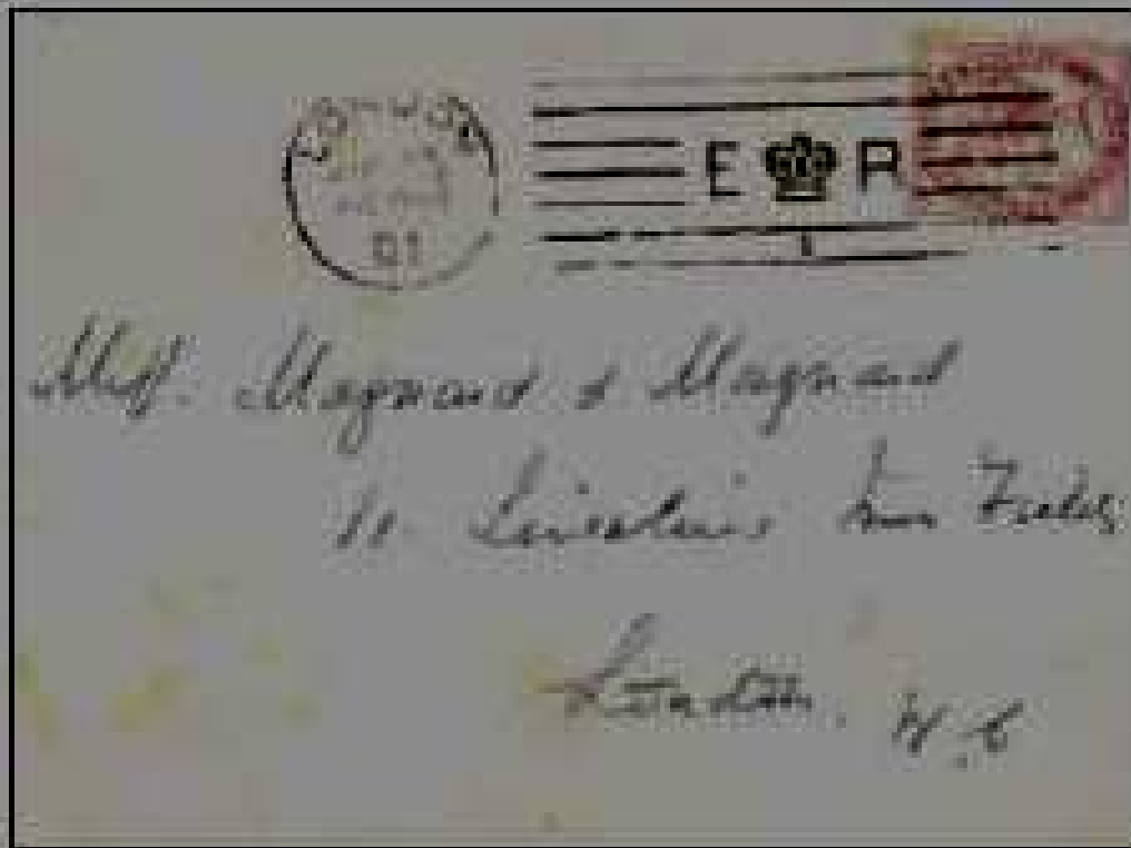
Fig. 35 — 'Bickerdike Machine' postmark with 'ER' in the obliterator but with 'Victorian Crown' on a domestic local commercial cover dated 15 July 1901.

The 'Bickerdike' Machine remained in field use for a number of years. The 'patriotic' postmarks from those six machines are collected in terms of their impression but also by use and destination.