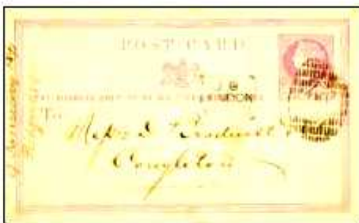
Fig. 16 — Postmark from the Second Trial on postal stationery cards (one month duration — 4 January to 4 February 1871) having a rectangular dater and an obliterator having '89' in the center. The rectangular dater is similar to ones used in the German trials which had commenced in 1867.

The machine itself was treadle-operated and could achieve a postmarking rate of 500-600 pieces of mail/minute. However, although the machine appeared to be ideal for the Post Office, it was ultimately rejected after three primary trials because it did not effectively postmark 10% or more of the mail which passed through it, and it required a high level of maintenance!