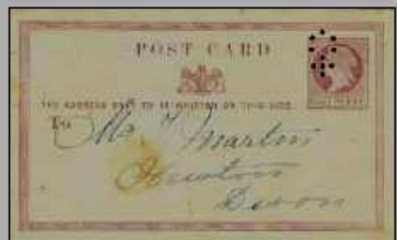
Fig. 18 — Sloper perforation 'Inverted Orb & Cross' on postcard dated 17 November 1870.