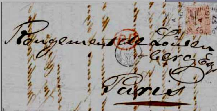
Fig. 3 — 'Pearson Hill' machine: the only known foreign-destination commercial mail (folded letter). Dated 16 December 1857 to France. Letter has ink-bleed from written text. 4d single-weight letter rate.

The early dies were manufactured of rubber and, of course, could wear, resulting in potentially illegible markings. So, Pearson Hill improved his field-test machine into a second type, which now used a metal die having the postmark code 'B' (see Fig. 4). Recorded use: 21 March – 23 April 1858.