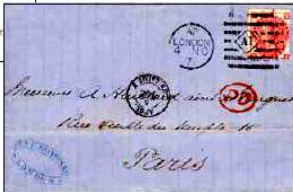
Fig. 15 — Postmark from the Second Trial with a coded dater dial having 'AP' on a Paris-bound commercial folded letter. Only known example of this code. 3d single-weight franking.