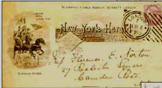
Fig. 21 — Example of a 'Type XII' Hoster marking on an early local advertising cover sent from the London office of the New York Herald newspaper.

The 'Hoster' machine was hand-operated having two postmarking dies able to postmark two pieces of mail with each rotation of the hand-wheel. During the field-trials and usage years 1883–1893, Hoster machines applied a number of different origin markings to out-going mail and also receipt markings to in-bound mail.