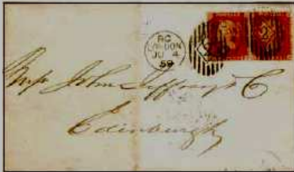
Fig. 9 — Postmark from Ridout's Test Machine 2, Type II. Double-weight domestic folded letter to Edinburgh. Double-weight letter-rate — 2d.