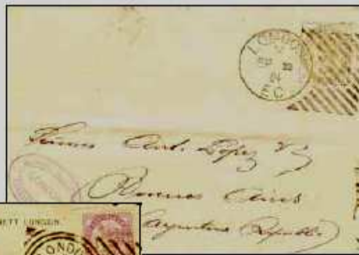
Fig. 20 — Example of an early Hoster on a cover dated 23 September 1884 from London to Buenos Aires, Argentina. Only known Hoster machine postmark on cover to that destination. 4d single-weight rate to Argentina.