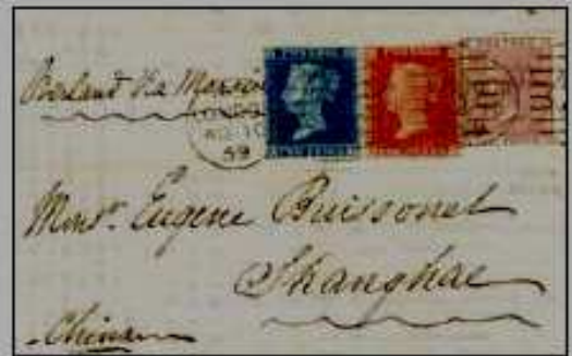
Fig. 11 — 'Third' postmark variety from Hill's 'Parallel Motion Machine' where the length of 'LONDON' in the dater dial is 16 mm in the dater-dial (instead of 14 mm) and with a '3' in a duplex obliterator having 14 widely spaced horizontal lines (instead of 17 thin lines). Cover: 10 August 1859, commercial (printed-circular) single-weight letter rate to Shanghai, China, 9d franking.