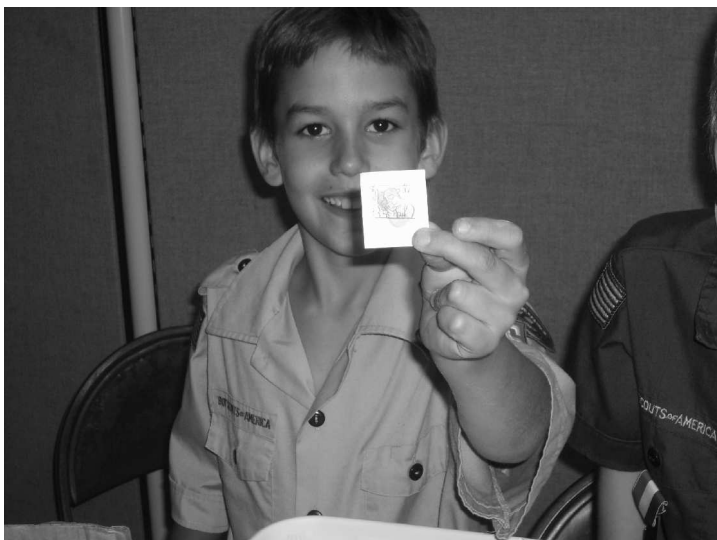
Fancy postmarks attract their eye. Here Noah (a cub scout) finds SHREK plastered on a stamp, and the boys dive into the stamp boxes looking for SHREK & DONKEY.

As collectors, the heavy SHREK cancel is unsightly, but for the boys they are a bonus.